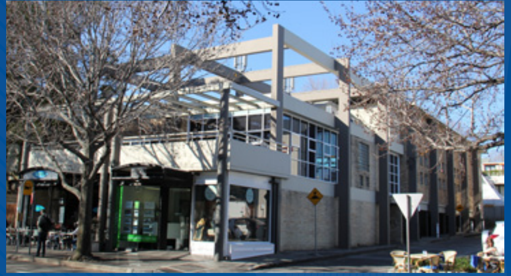
Council House Today