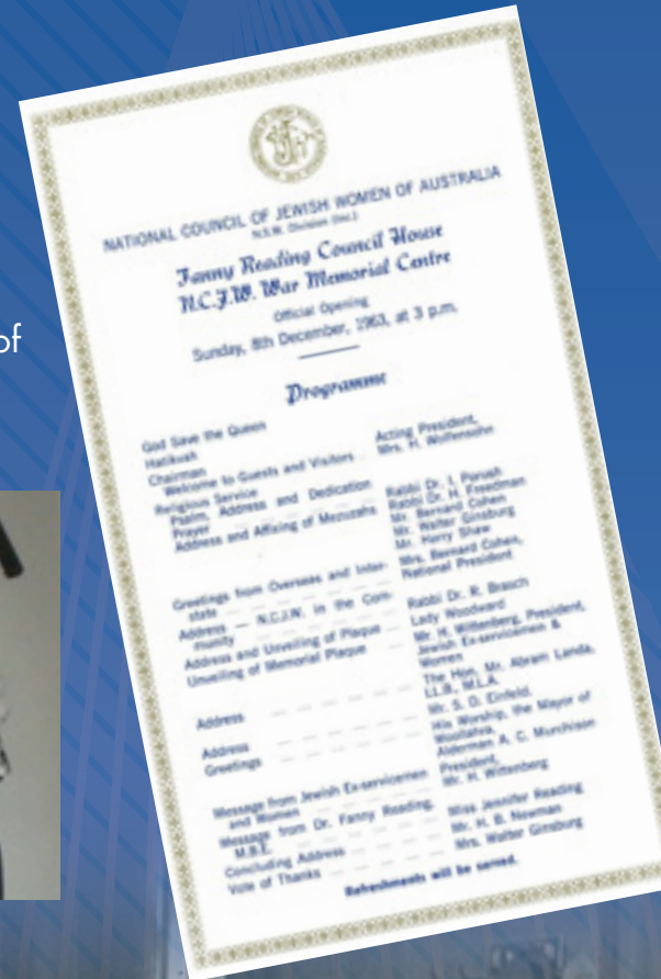
Program at opening of Council House