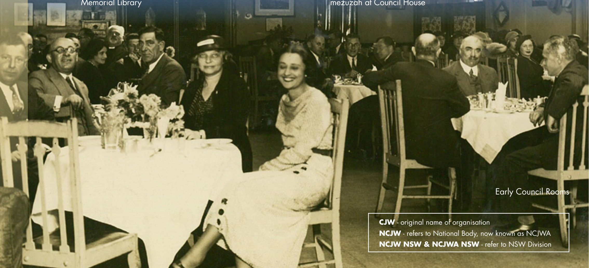
Early Council Rooms

CJW - original name of organisation NCJW - refers to National Body, now known as NCJWA NCJW NSW & NCJWA NSW - refer to NSW Division