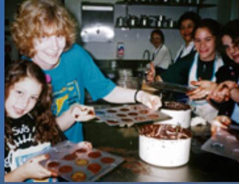
Cooking at Council House